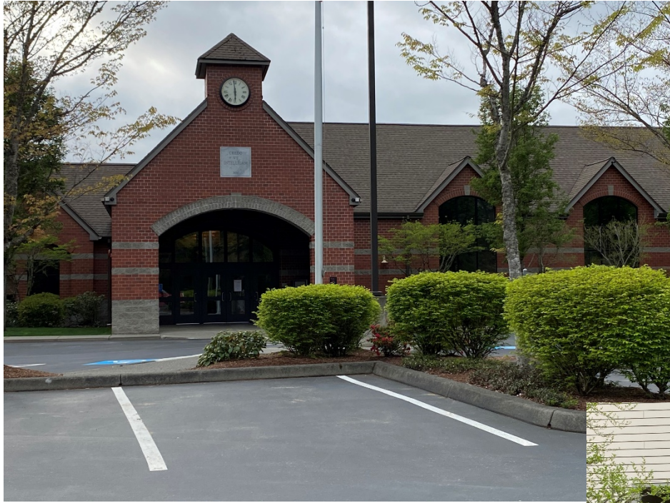
Main Entrance: Door 1