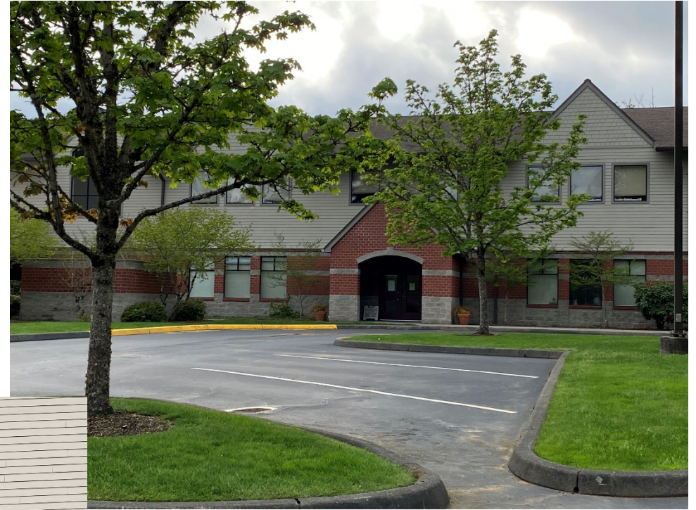
Loop: Door 3