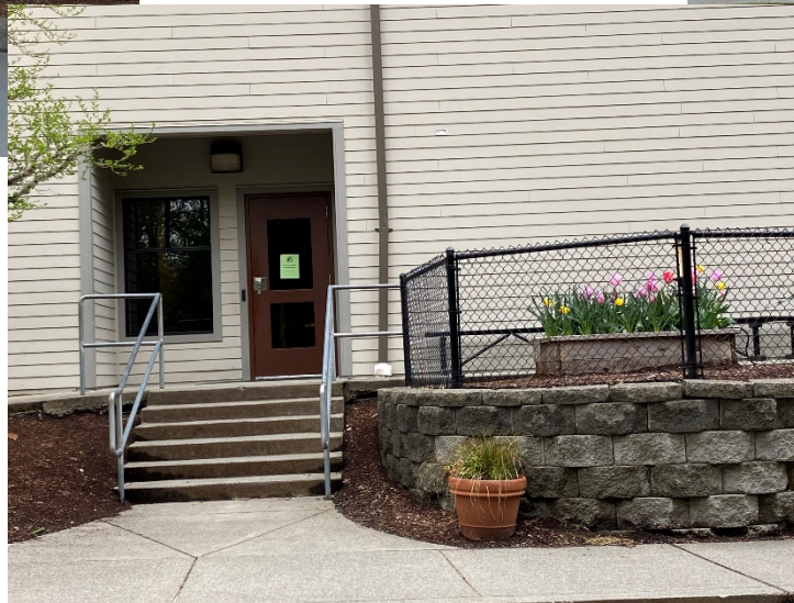
Kindergarten Hallway: Door 6